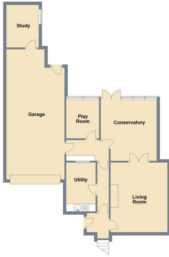
Lower Ground Floor Approx. 91.0 sq. metres (979.6 sq. feet)